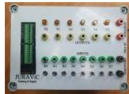
micro PLC Trainer (NAIS, Mitsubishi, Omron, Siemens)