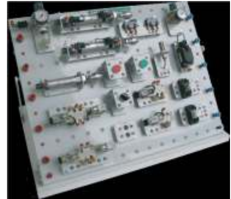
Standard Pneumatic & Electro-pneumatic Trainer

Expandable – add the components you need