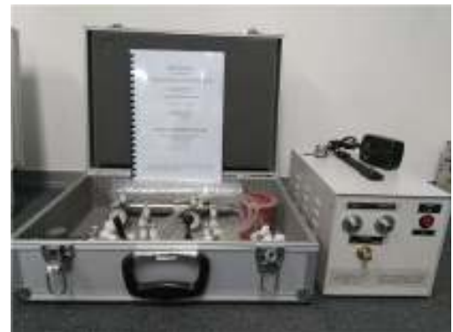
micro Hydraulic Trainer (Water Power Unit)