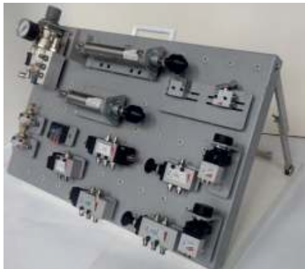
micro Pneumatic Trainer Plug board